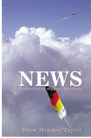
News: Postcards from the Four Directions by Drew Hayden Taylor, Talon, 288 pages

Almost 100 'postcards' make up this collection of Drew Hayden Taylor's "personal musings, wanderings, impressions of the Native community, as well as many other communities in Canada and the world." Although the topics range from Aboriginal science fiction to the Olympics and trying to find mortadella in Curve Lake, the Ojibway novelist, playwright and screen-